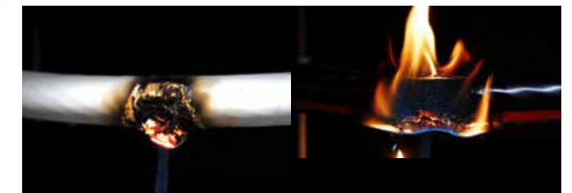
Cable Protected with Scotch® Fire Retardant Electric Arc Proofing Tape 77 During Test Unprotected Cable During Test