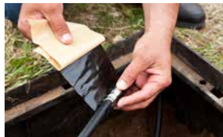
Scotch® Vinyl Mastic Tape 2200 and 2210

3M and Scotch brand Mastic Tapes are an excellent choice when you need to create watertight connections. Mastic tapes also work wonders to pad sharp edges and to smooth out irregular shapes and transitions, plus they're soft enough to mold by hand. The extra padding offered by mastic tapes provides protection against vibrations that may wear through other materials over time.