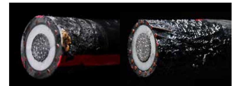
Cable Protected with Scotch® Fire Retardant Electric Arc Proofing Tape 77 After Test Unprotected Cable After Test

Adhesive-free design enables removal for cable or accessory inspection